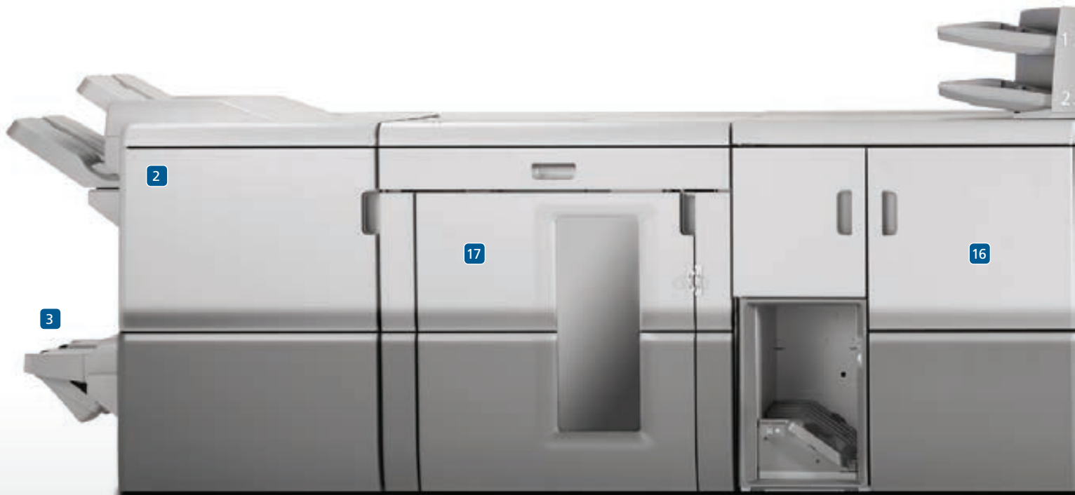
RICOH Pro 8100 Series